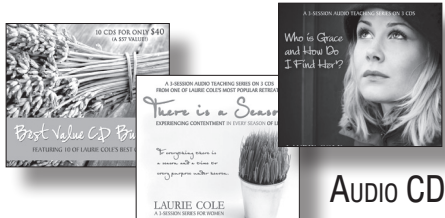
AUDIO CD SETS